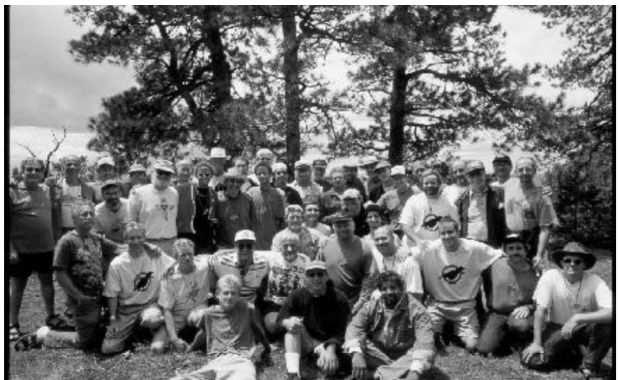
The group photo for the Men's Wellness Summer Gathering, 1999